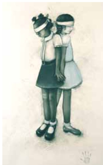
Lorraine Garcia-Nakata - Friends, No Matter What , 2008 Charcoal, pastel on paper