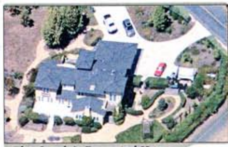
The Oracle's Disputed Home

Five-year Red Tag Dispute Resolved by Judge in Civil Suit